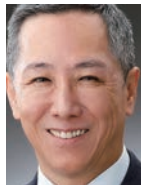
Taro Kono (Japan)